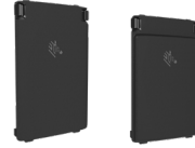
Batteries (3300 mAh, 5260 mAh)